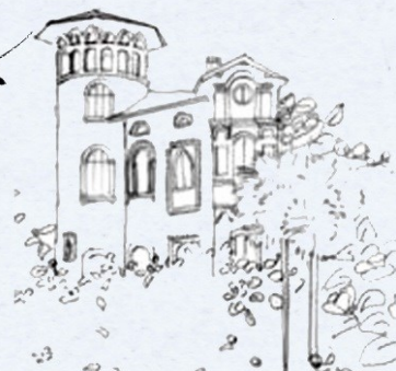
Camelie in Jugendstil Villa