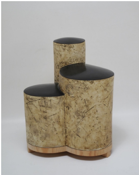
Shida Kuo, "Untitled" No.21-01 , 2021 Fired clay, metallic oxides and wood, H37 × W31 × D23 cm