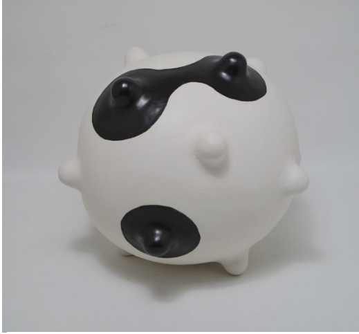
Shida Kuo, "Untitled" No.21-04 , 2021 Fired white clay, metallic glaze, H36 × W41 × D36 cm