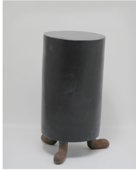
Shida Kuo, "Untitled" No.22-01 , 2022 Fired clay, metallic oxides and wood, H45 × W28 × D28 cm