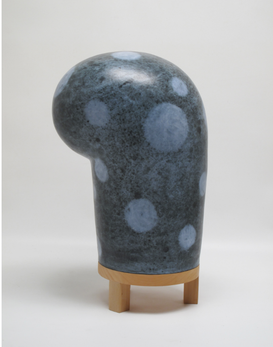
Shida Kuo "Untitled" No.18-15 , 2018. Fired clay, metallic oxides and wood, H43 × W25 × D23 cm/H17 × W9.8 × D9 inches ©Shida Kuo