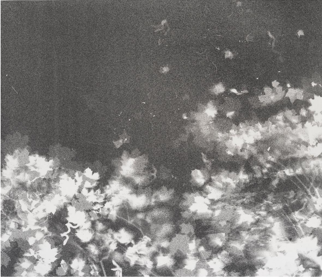
Yuichiro Kikuma, Traces of the Summer no.8 , 2022, Sumi ink on Calico, H51.1 × W63.7 in.