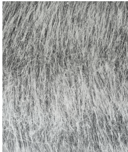
Yuichiro Kikuma, Traces of the Summer no.10 , 2022 Sumi ink on Calico, H63.7 x W51.1 in.

For more information and images, please contact: