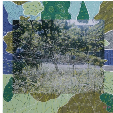
Torulshii & piczo, Spoder_8144 , 2023, Inkjet print on Hahnemuhle paper with Yuzen technique, colored paper, pigment. Wood framed, H72.8 × W52.5 × D2.0 cm/H28.6 × W20.6 × D0.7 in.

For more information and images, please contact: Miyuki Kanada, info@gallery-sokyo.jp